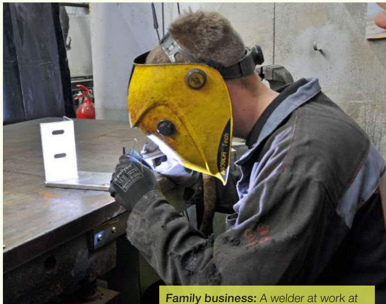
Family business: A welder at work at Elite Fabrication & Welding.

"We know our staff, our customers and have the ability to be agile and flexible in how we run the company whilst also building a legacy that could be passed on in the future."